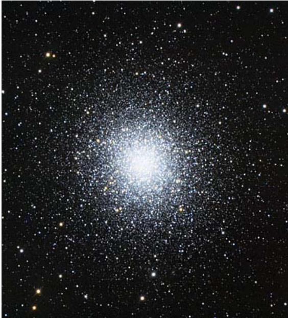
M13 in Hercules

Here we are in Summer again and the Constellation Hercules is up there for all to see. The Great Cluster transits about 11:30 P.M. so after dark he is high enough to be seen to the east. This cluster is unrivaled in a telescope except for M22 in Sagittarius.